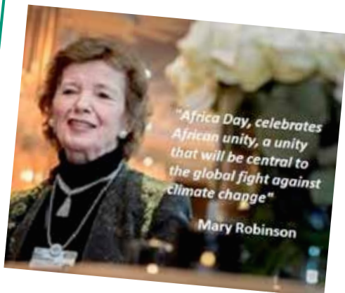
Mary Robinson, Head of Mary Robinson Foundation for Climate Justice http://www.mrfcj.org/our-work/areas-of-work/womens-leadership-on-gender-and-climate-change/

Women and young girls are facing disproportionate impacts of natural disasters brought by climate change, and thus combating climate change is key to achieving women's rights and universal access. Recognizing and acknowledging the relationship between climate change and gender equality and acting upon the need to address the increased vulnerabilities brought upon by climate disasters can have a far reaching and a more sustainable impact on the climate change mitigation and adaptation efforts." Link: http://arrow.org.my/why-more-women-are-needed-in-the-climate-negotiations/